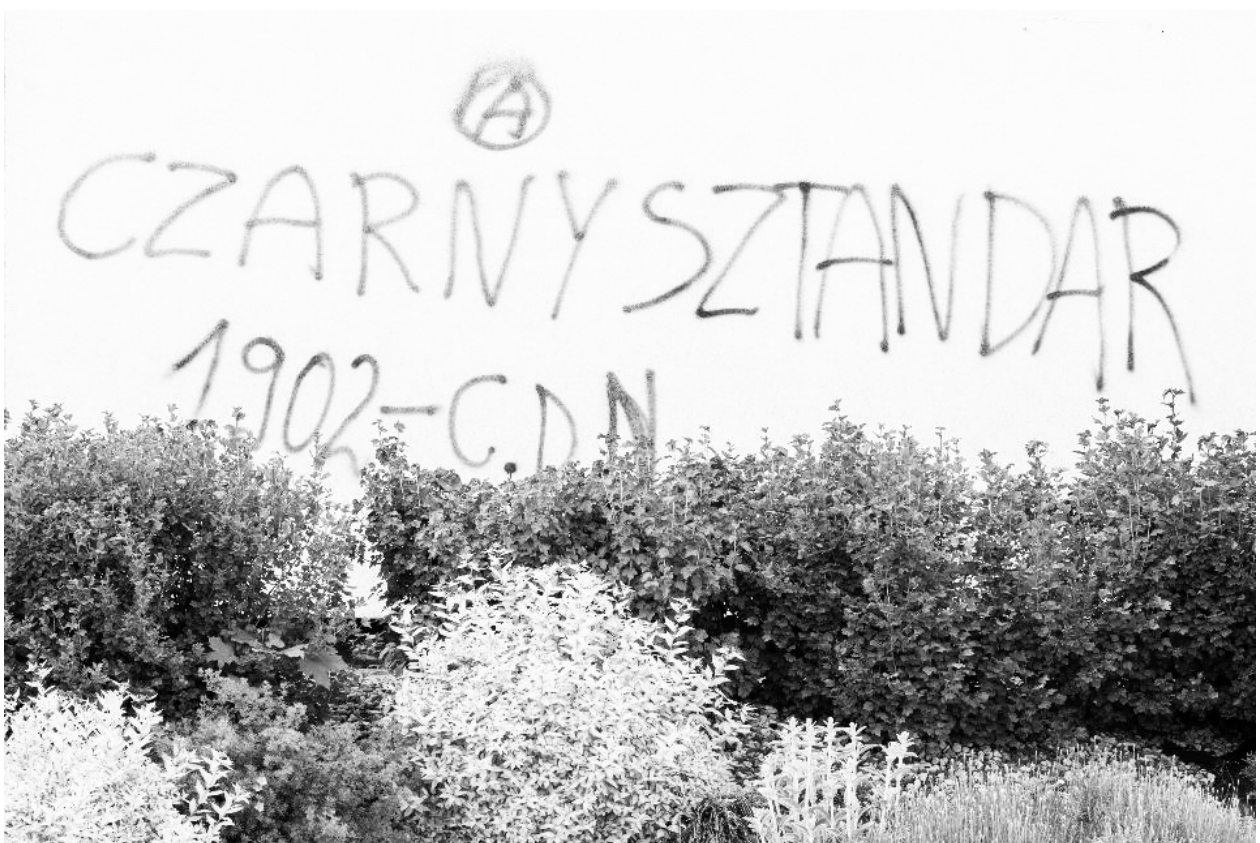
Anarchist graffiti in Białystok, 2021. "BLACK BANNER 1902-T.B.C."